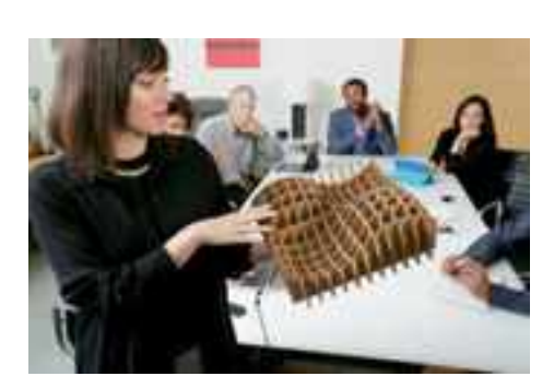
For razor sharp close-ups of objects and whiteboard content, the GROUP camera offers 10x lossless zoom, enabling your team to see every detail with outstanding resolution and clarity.

GROUP offers the flexibility to customize conference room set-up with multiple camera mounting options. Use the camera on the table or mount it on the wall with included hardware. The bottom of the camera is designed with a standard tripod thread for added versatility. Conference participants can also clearly converse within a 6 m/20' diameter around the base, or extend the range to 8.5 m/28' with optional expansion mics.